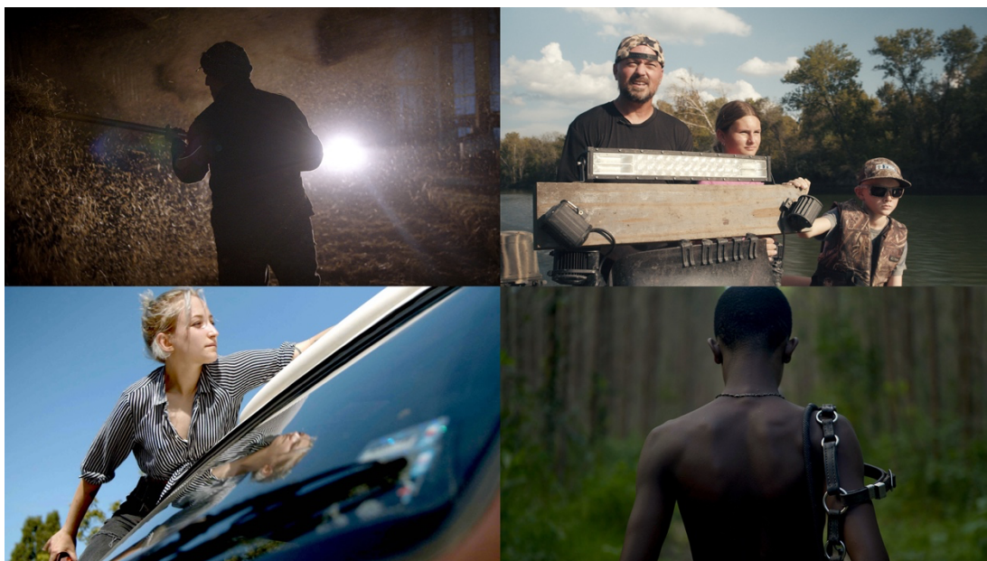
© Tale of Baba, Road 190, Songs of Sisterhood, Helvécia

Four powerful projects will be presented at the 2024 Cannes Film Festival during the exclusive Docs-In-Progress showcase, representing established and emerging voices of contemporary Swiss cinema.